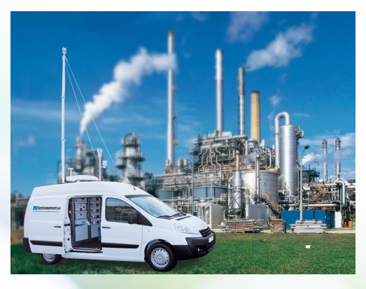
Example of turnkey mobile air quality monitoring station manufactured by ENVEA